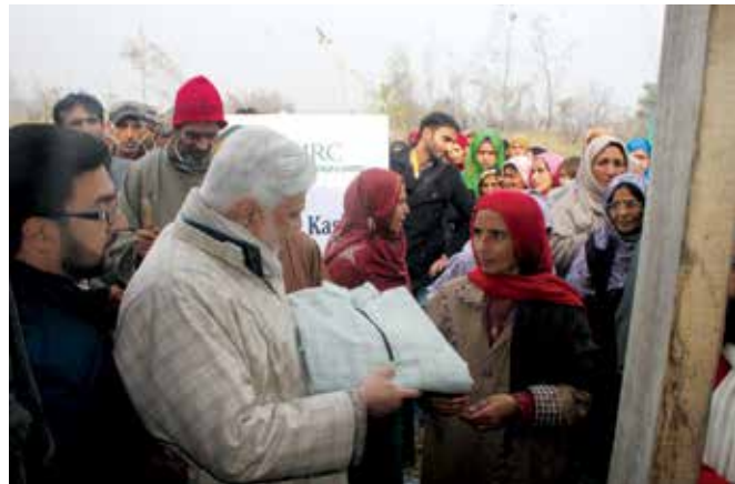
Within small villages we could distribute relief packages without interference from outsiders.