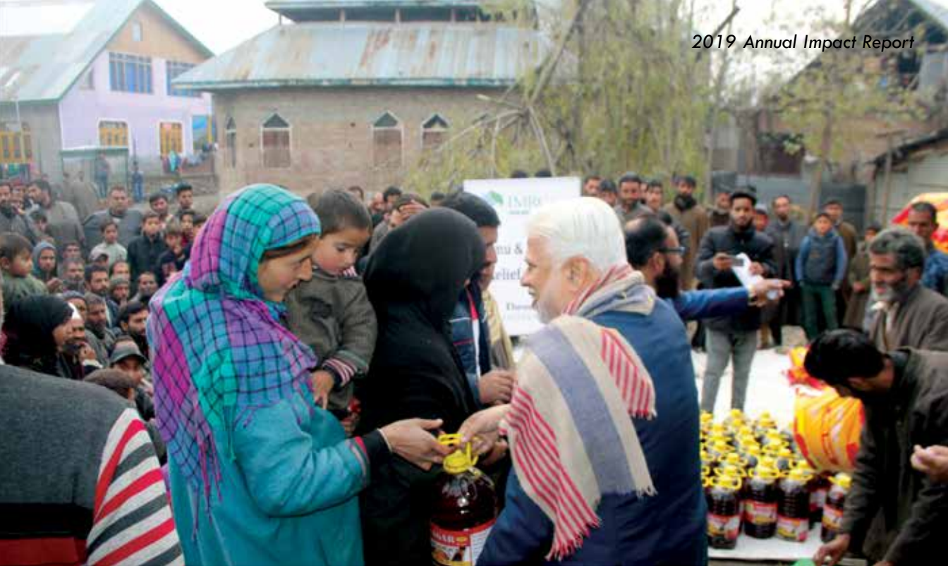
Kashmir Visit Nov. 2019

We are thankful for our dedicated team of Board members and Chapter volunteers who share the common goal of helping meet our objectives and serve our mission. Without them, IMRC could not move forward in serving the minorities and Muslims of India.