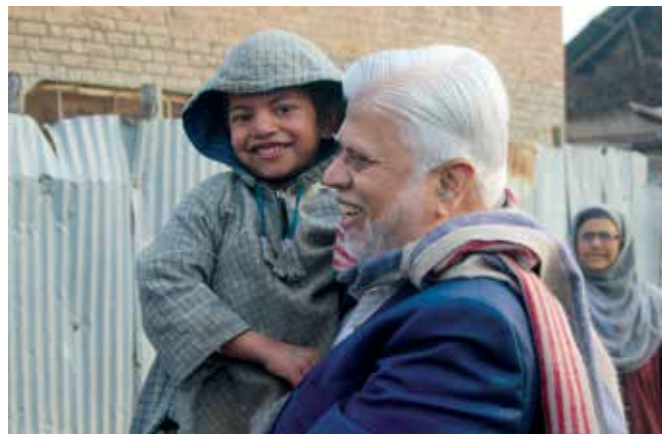
Children were so happy throughout Kashmir. You didn't hear of grief or sorrow.