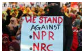
Women led Shaheen Bagh Protest