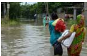
Floods in Assam, Maharashtra and West Bengal