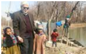
Harsh winter in North India, including Kashmir