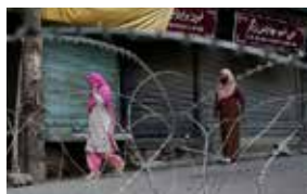
Article 370, Kashmir lockdown