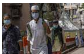
Corona & Tablee-ghi conspiracy