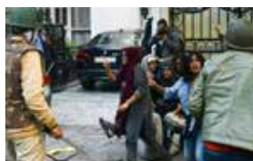
Protests in JNU and Jamia Millia