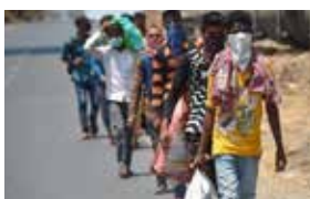
Covid 19, India's lockdown