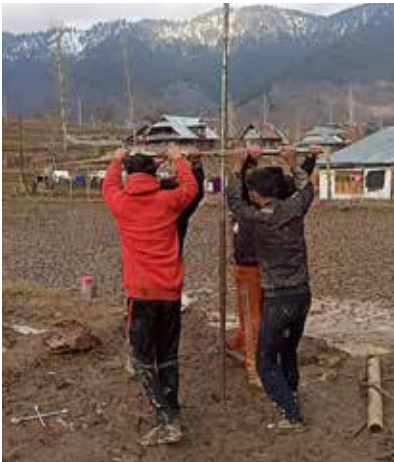
Kashmir Bore Well digging

*Balance included Restricted Donations/Projects that shall be disbursed in 2021.