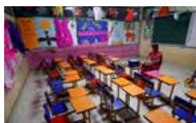
Over 2 million teachers & imams affected with school/masajid shut down