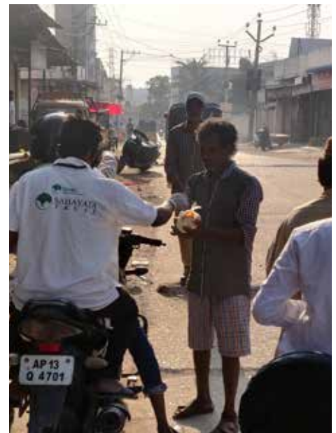
IMRC Volunteers pass out cooked meals during curfew open hours throughout the city via bike.