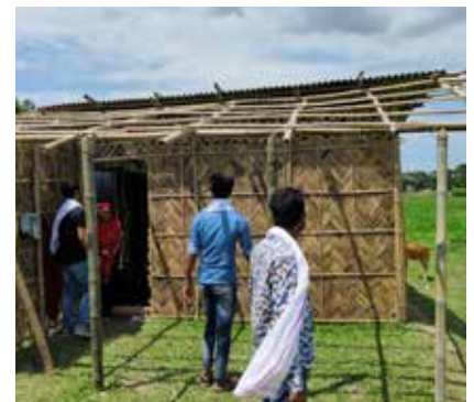
BIHAR WEST BENGAL Flood relief and rehabilitation for hundreds in progress