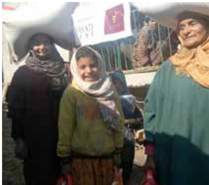
KASHMIR 1500 received rations and clothes