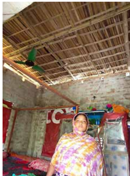
A Bihar cyclone victim now has shelter. She stands in her home with a new roof sponsored by you.