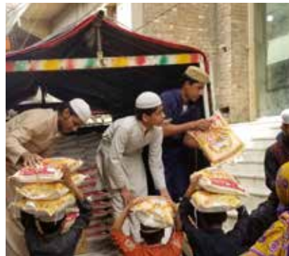
DELHI RIOTS 1000 families assisted with food packages