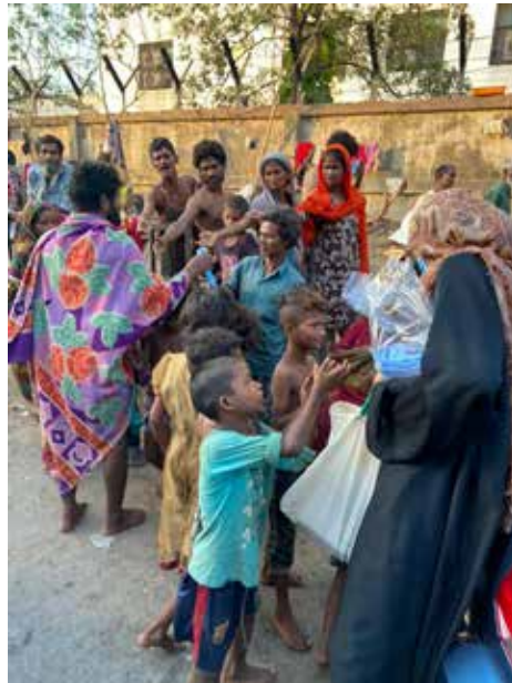
Youth Volunteers pass out PPE supplies to those stranded on the streets due to lockdown.

Jazah Allah khair for all of it! Our work will continue, inshAllah, and we hope you'll be there with us to make it happen. May you and your family be blessed always!