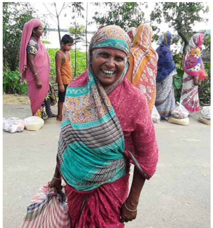
A flood victim in Assam receives a food kit. August 2020

When you donate to IMRC, you are supporting a network of more than 100 organizations in India which range from providing services in education, social welfare, hospitals, medical clinics, emergency relief and much more.