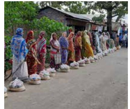
ASSAM - Floods 1000 families assisted with grain packages