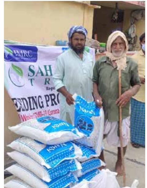
An IMRC Volunteer gifts an elderly man with a grain package in Gujrat.