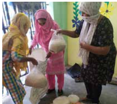
BIHAR GUJRAT Rations and cooked meals for thousands