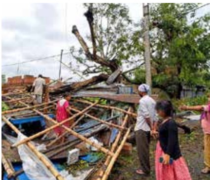
WEST BENGAL MAHARASHTRA Cyclone victims received relief support