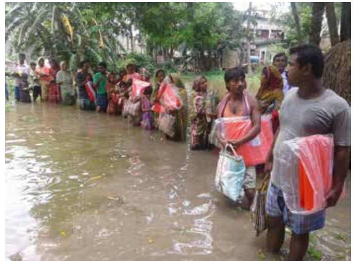
West Bengal flood victims receive shelter supplies, clothes and grains.