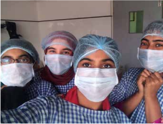
Gearing up to watch knee surgery at Indo-US Hospital.

search of her. Now as a six year old, he dreams of becoming a police officer to protect the people of his community. It's not every day you meet kids as hopeful and uplifting as these beautiful souls. I wouldn't trade anything in the world better than the experience of getting to know them.