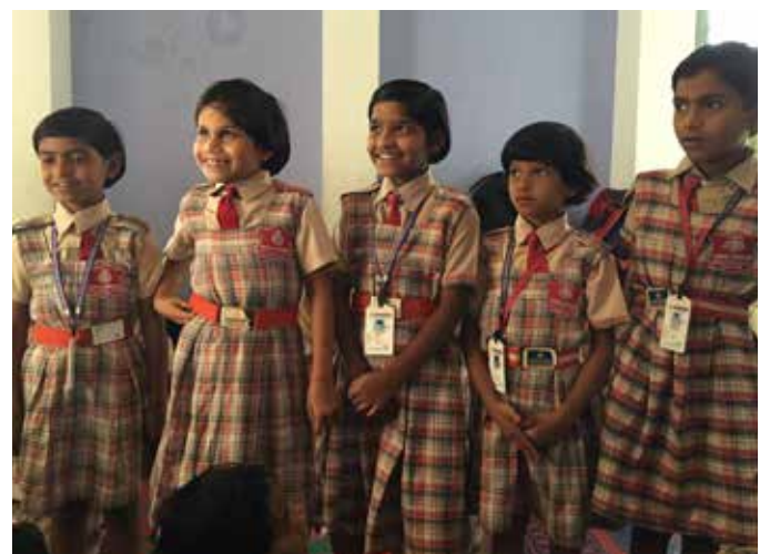
The 1st graders at the Challenger Girls Hostel.

Our first stop was a suburb of Hyderabad to visit the IMRC Indo-US hospital, responsible for providing medical aid to the underprivileged. What I knew before were mere numbers on paper; over 2500 dialysis sessions, over 19,000 patients treated but what I experienced on the ground was