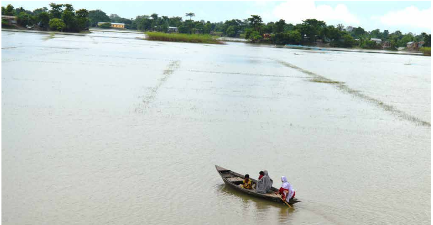
A family traveled by boat across the flooded area to be seen at a free health camp and receive medicine.