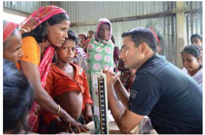
A volunteer doctor at a free health camp assists a victim of the Assam flood.

Jazakh Allah khair for your support. Without your contribution and support we couldn't have responded as quickly with the much needed supplies. Our goal every time we provide relief is to have our team on site within 24 hours of the calamity for assessment and immediate action.