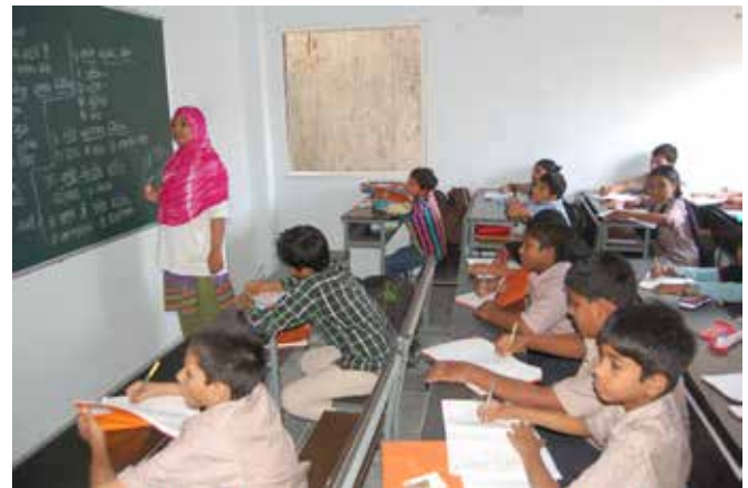
One of the new schools that has opened in the slum areas.

Support schools in slum areas to truly tackle the education system amongst minorities & Muslims.