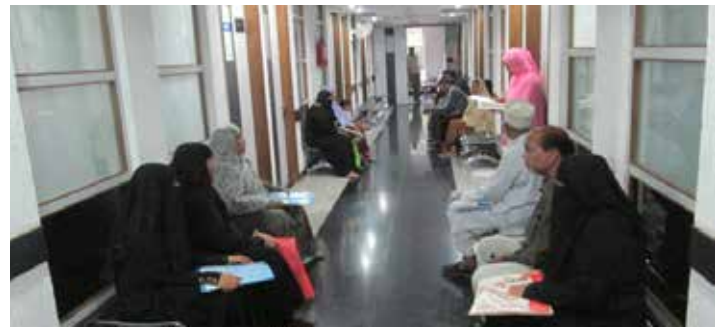
Patient waiting area.