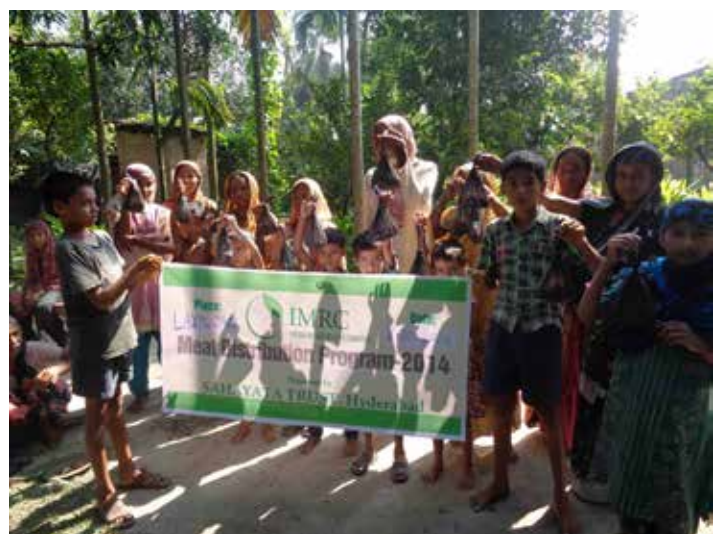
A village show their meat packages received on the day of Eid.

You helped make Eid-ul Adha exciting for 110, 000 families. Jazakh Allah khair! We look forward in your support for next year's program too. We appreciate you choosing to perform your Qurbani through IMRC.