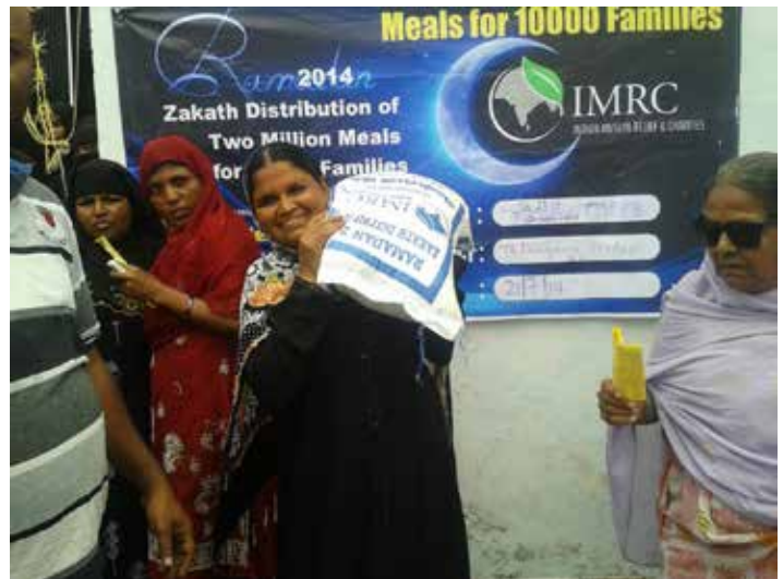
A woman receives her Fitra package.

With each distribution to a family, child or elderly person, we discover other areas of need too. Thanks to you, we have been able to continue this program for 33 years. Jazak Allahu Khair for giving the less fortunate families, communities and villages a meal to look forward to during this blessed month.