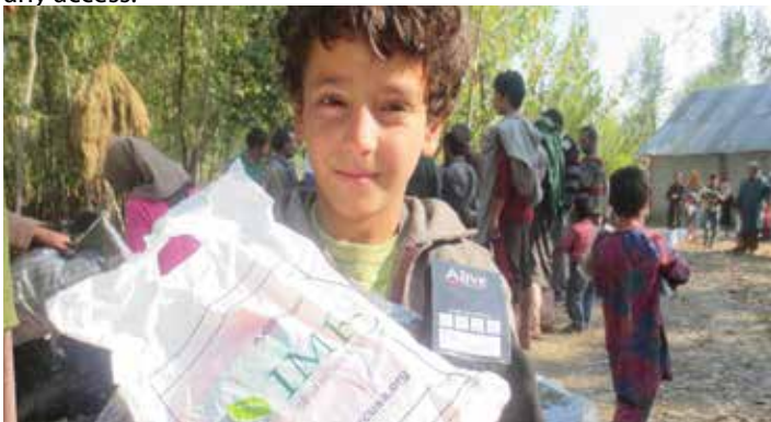
A Kashmiri boy receives his relief package. October 2014

An estimated over 200,000 were lucky to escape to refugee camps; those too now overflowing with lack of proper supplies. However, over 5 million victims were displaced, over 2,000 villages were destroyed and over 400 dead from this tragic disaster. In October, floods also struck in Andhra raising the total toll to over 6 million victims. As water levels dwindle, dead bodies and animal carcasses are found; increasing the risk of wide spread disease and epidemic. More refugees were discovered in areas such as Baramilla and Sopore as rivers continue to change their paths leaving many towns and villages without any access.