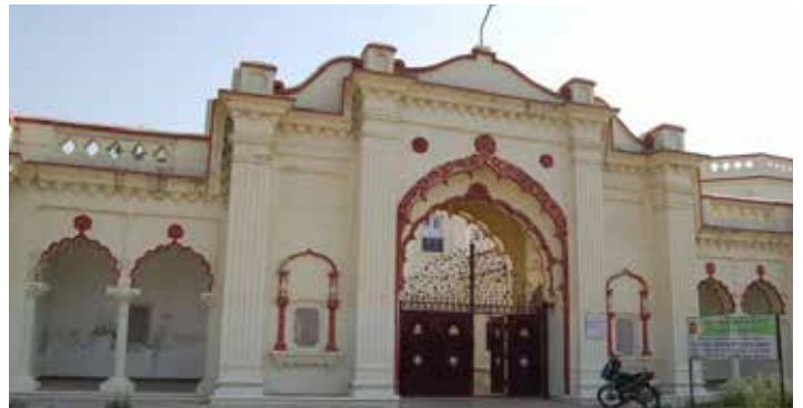
JIT Main Gate Entrance