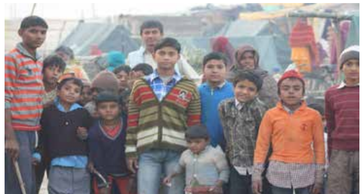
Children at a temporary refugee camp during winter.

One year later, the riot victims of Muzaffarnagar are still in process of trying to move on and rebuild their lives to become self-sufficient again. Riots which broke out in August 2013 left 50,000 displaced and homeless, 113 dead and 250 villages affected. IMRC is continuing to provide relief, food and clothing for the victims. Our Emergency Relief program is what makes it possible to continue to provide victims with supplies and aid. As winter is here these victims will be in dire need of help. Please send your support as soon as possible!