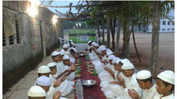
Children get ready for breaking fast during Ramadan. They sit outside their new local masjid/school and look forward to their sponsored iftar.

It's costs approximately $20,000 to construct a new masjid/school. At each location, we provide daily activities and services based on the needs of the community. Our goal is to continue to expand to nearby villages and build one masjid/school per month. Thank you for your continued support and making this project a success.