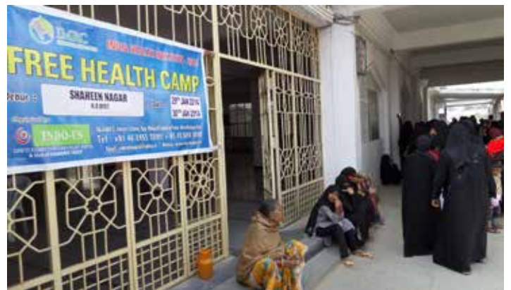
Many travel from afar to wait in line for hours just to be seen.

In many cases, those living in rural and slum areas do not have access to treatment and/or cannot afford to be seen by a doctor. Fifteen volunteer medical professionals ranging from surgeons, ophthalmologists to ER specialists and geriatrics teamed up with local Indian medical professionals to help treat the sick in rural and remote locations. Each year we rely and encourage others in the medical field to volunteer their time and expertise for the needy. We hope you can join our next program coming up in January 2015. Please contact us for more details.