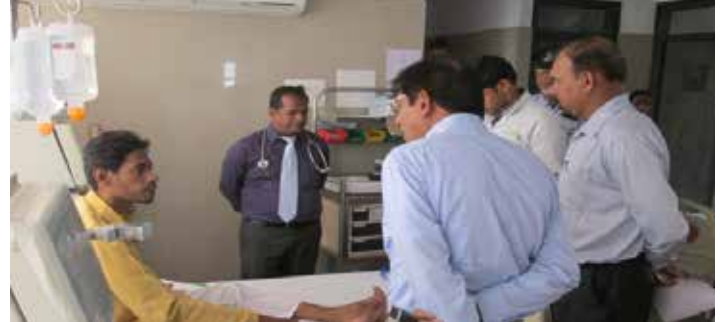
Doctors stop by to follow up with a patient at the Indo-US Hospital.

Through your help and support, we will be able to expand our services and treatment and healthcare to growing communities and rural areas at an affordable cost. It is a blessing to see such services offered to the public who are in need of medical attention. Educational courses are also offered to help educate the public on their healthcare which can make an impact on their daily lifestyle and habits.