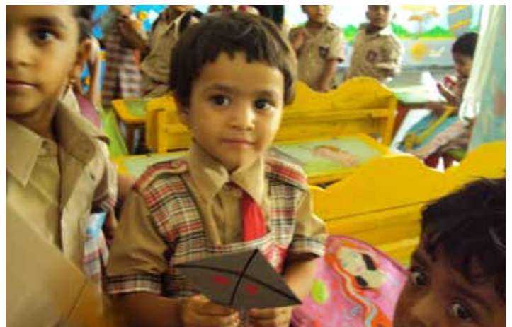
Nursery school children show their projects created in class.

Enrollment has increased from 80 students in 2010 to now 551 in 2014. That's an over 650% increase! Thank you for making this school a place of quality learning and opportunity for all.